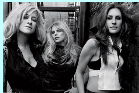
The (Dixie) Chicks